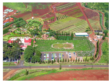
Dole Plantation Pineapple Maze

Bobby Banana is a mascot of Dole Food Company and the leader of the SuperKids (children who regularly eat five to nine fruits and vegetables every day). [15] He is an anthropomorphic banana, who appears in Dole comics and games for children, along with friends Courtney Cauliflower, Mia Mango, Pinellopy Pineapple, and Gavin Grape, all of whom are also anthropomorphic fruits and vegetables. [16]