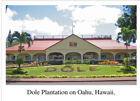
Dole Plantation on Oahu, Hawaii.

The company traces its origin to the 1851 establishment of Castle & Cooke by missionaries Samuel Northrup Castle and Amos Starr Cooke. Castle & Cooke rapidly became one of the largest companies in Hawaii, investing in shipping, railroad construction, sugar production, and seafood packing. That is why Dole today uses the name Duo for their juices. The other half of Dole's corporate heritage, the Hawaiian Pineapple Company, was founded in 1901 by James Dole, who opened his first pineapple plantation in the central plateau of the Hawaiian island of Oahu. Sanford Dole, the cousin of James, had been president